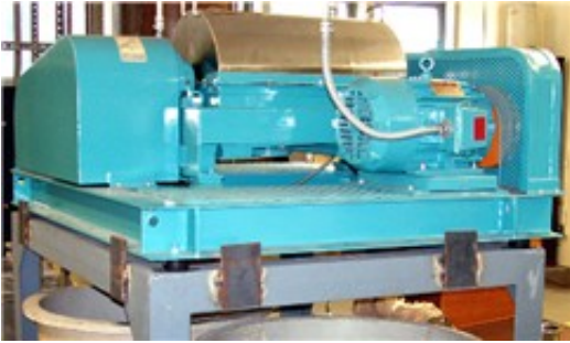
Sharples Centrifuge Manual