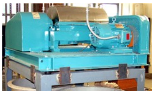
Aris 7 keygen

Super centrifuges for such applications are called Clarifiers and are often provided with only one set of discharge ports.. Academia edu is a platform for academics to share research papers How super centrifuge works This sectional view of a Super-Centrifuge shows the application of centrifugal force to a mixture of two immiscible liquids containing some suspended solids. Neobux Money Adder Software